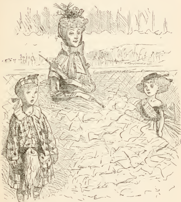
MRS. SALTONSTALL AND FAMILY.

more operative than before, sat on stools eating bonbons , while a French maid and the African footman hovered in the background.